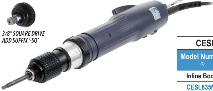
3/8" SQUARE DRIVE ADD SUFFIX '-SQ'

CESL8_M Series Screwdrivers incorporate an aluminum front collar to facilitate fixture mounting and include an accessory side handle for handheld applications.